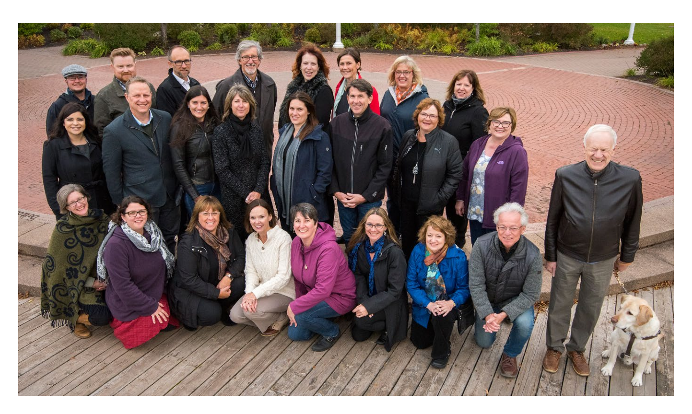
Annual Federal/Provincial/Territorial Meeting of Canada's Information and Privacy Commissioners, Charlottetown, PEI, August, 2019

Finally, I would like to welcome the new Information and Privacy Commissioner, whoever that might be, and wish them all the best as they continue the important work of this office.